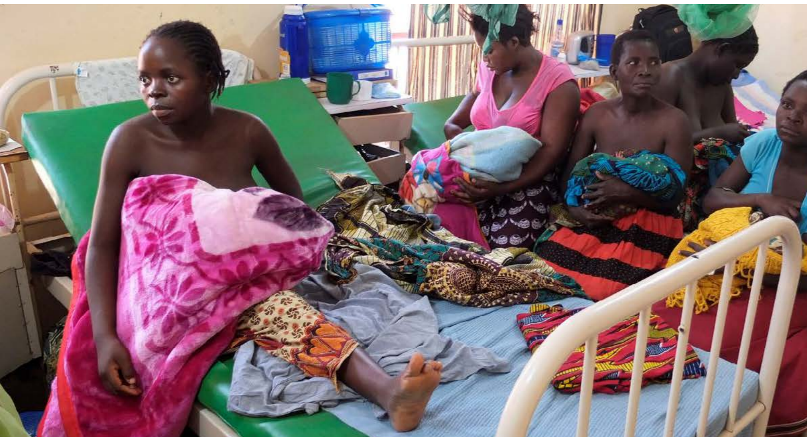
A KMC ward, Malawi