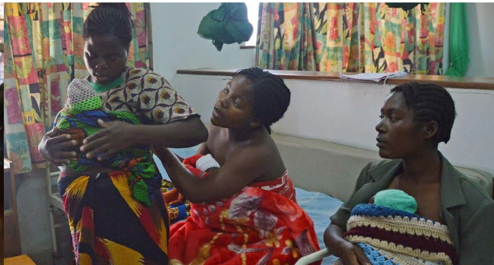
Mothers helping each other with the wraps, Malawi