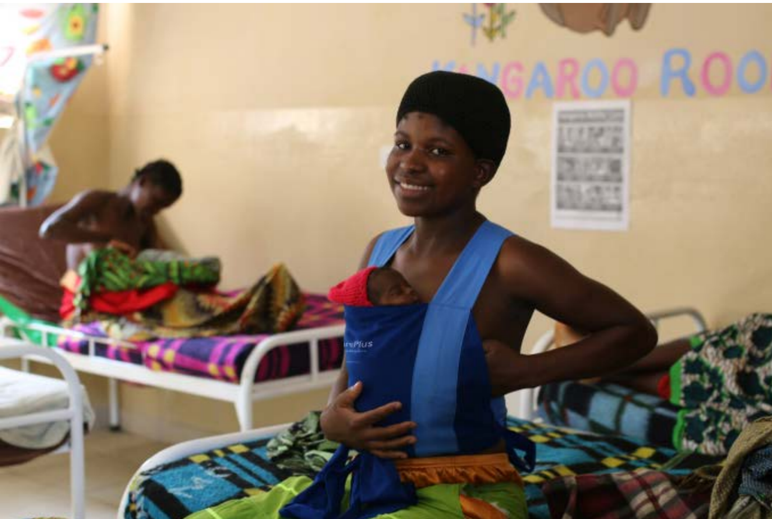
A mother trying CarePlus for the first time, Malawi

Although reasons for low uptake are complex, our studies show that a wrap has the potential to help increase the uptake and quality of KMC. We look forward to collaborators to optimise on the implementation models to make it available and affordable.